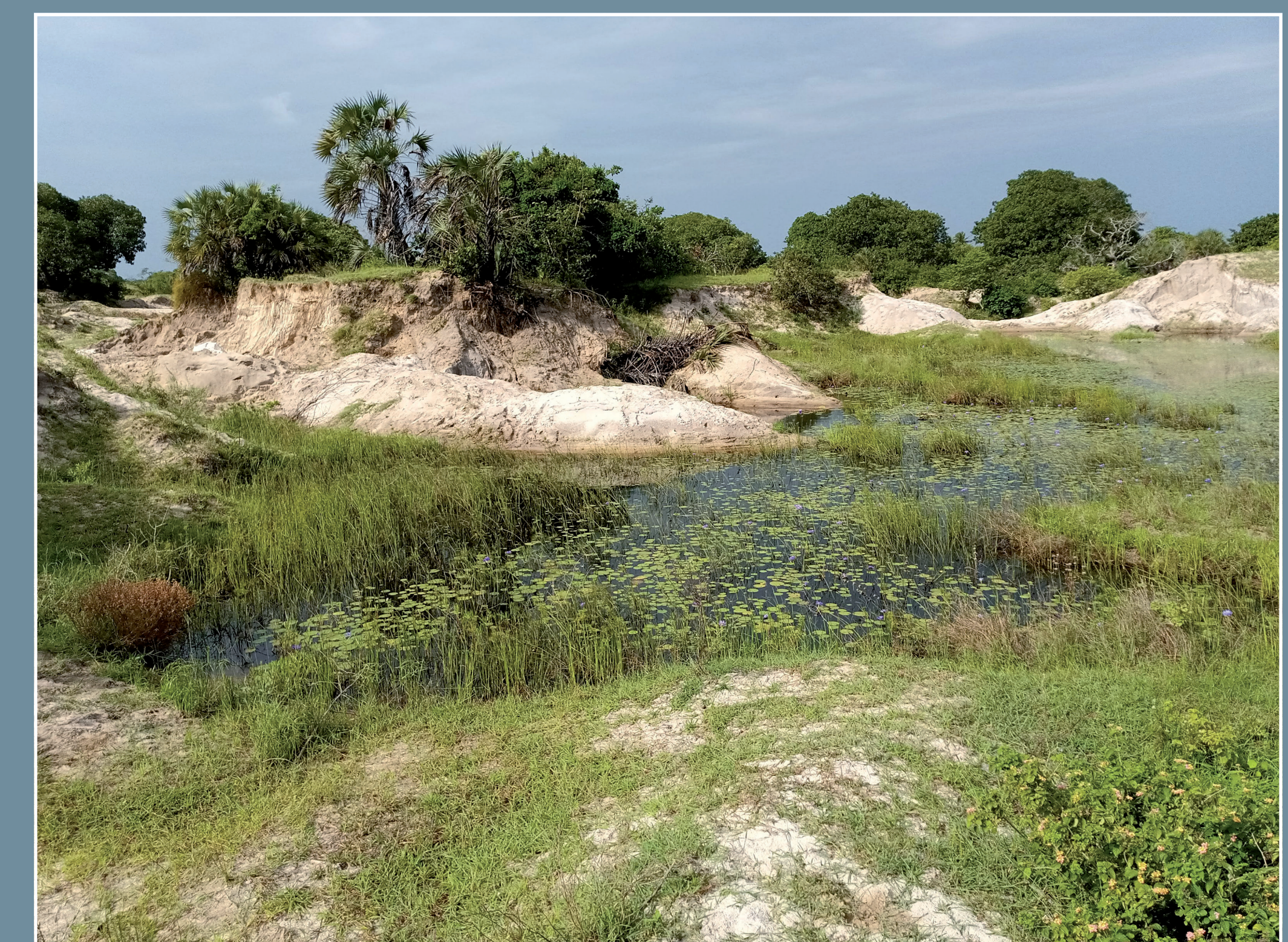
Abandoned Silica Sand Mine in Msambweni.

This document is the initial work since the licensing process for the Artisanal Miners has not yet begun in the country. It may not be comprehensive and exhaustive and therefore further input will be highly welcomed in seeking to improve it.