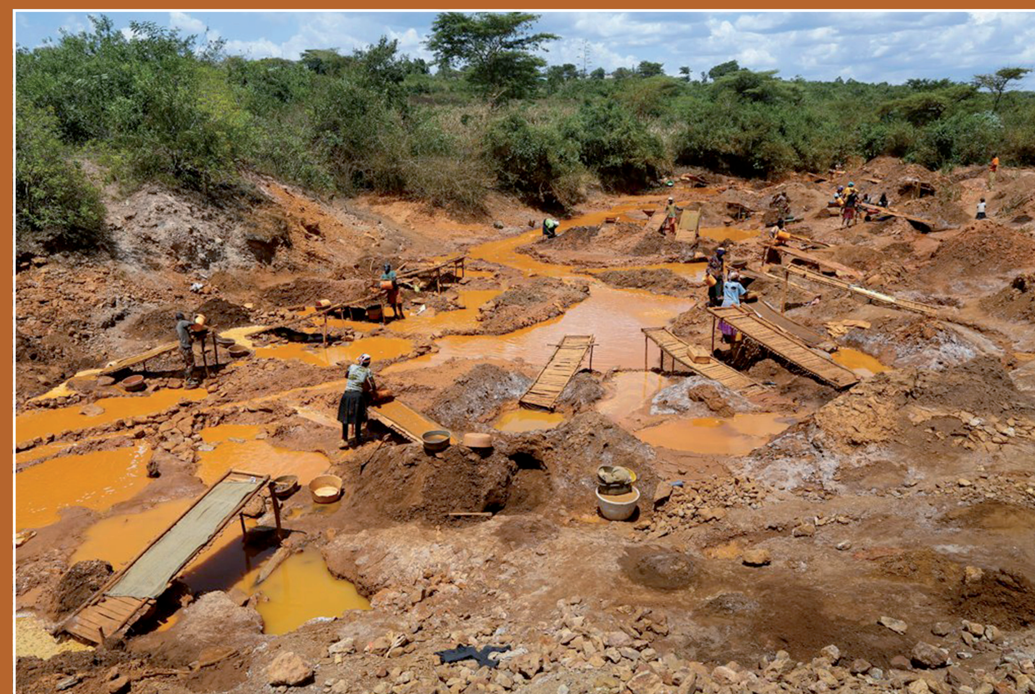
Migori Artisanal Gold Mine.

The aim of this project is to develop a training manual for the Artisanal Mining Committee. The goal of developing the training manual is to create a standardized reference document that is going to help Artisanal Mining Committees to be successful in their operations. However, for this part, the project will focus on the review checklist for the permit issuance and renewal requirement.