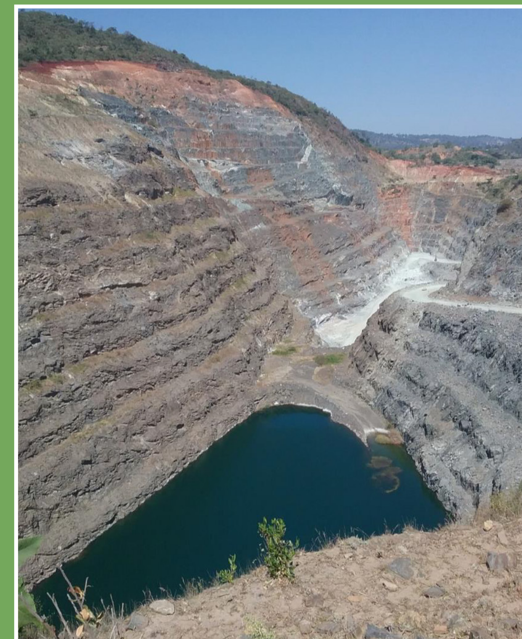
Photograph showing open-pit mining at Legadembi.

One page of mine closure program has been reported by mining companies as part of Environmental Impact Assessment (EIA). Even the environment and climate directorate working under the ministry didn't have awareness about planning mine closure before the mining commenced. So this guideline is anticipated to aid companies and authorities to plan and assess mine closure and submit a separate or detailed mine closure activities together with its cost before the mine start.