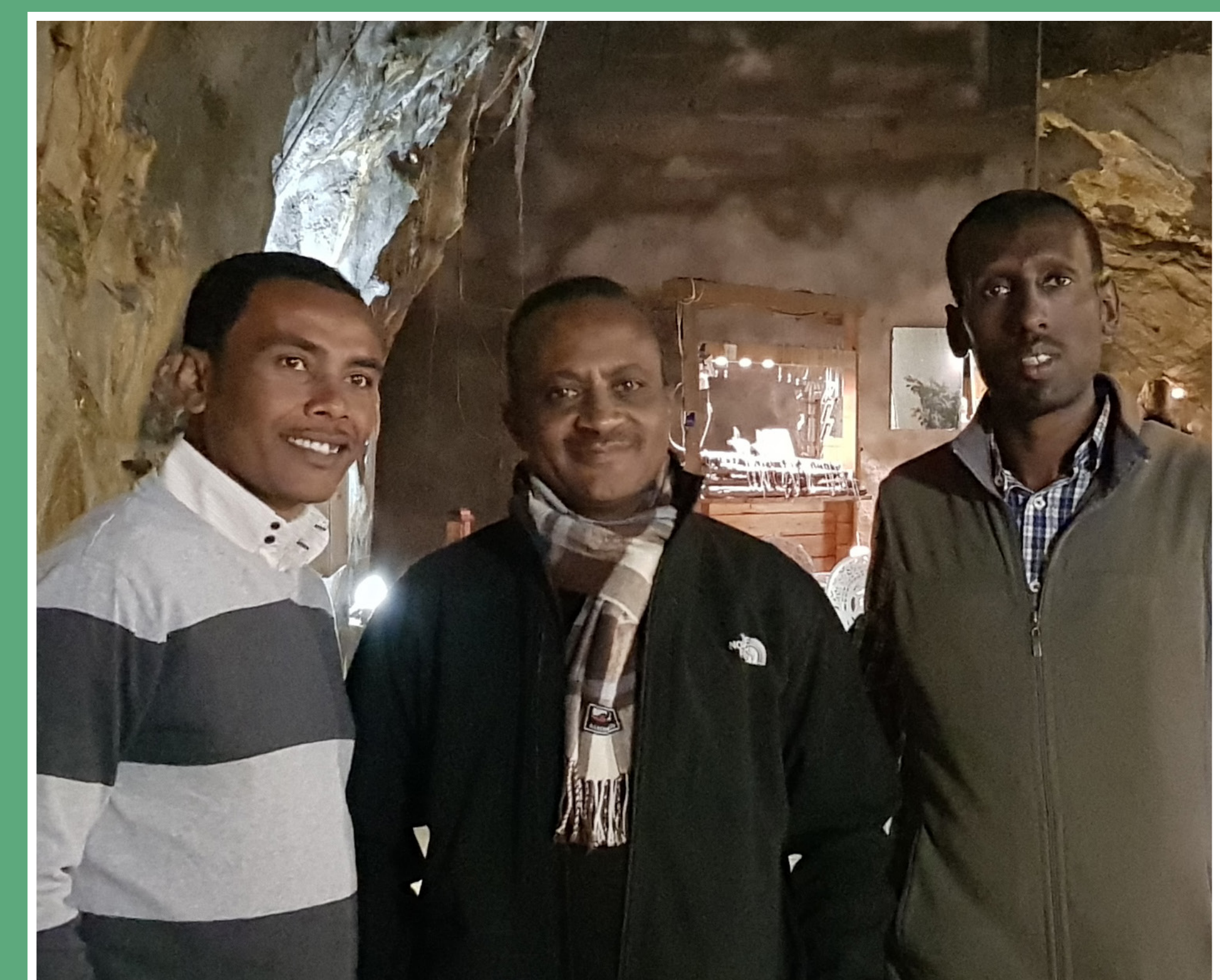
The change project team members.

The people and the environment at artisanal mine sites must be protected from any negative impacts from artisanal mining. The miners and the society around the mine site also be informed about potential dangers, immediate or long term. The miners and authorities must be aware of potential dangers, know how to avoid these, how to lessen the effect and how to safely close a mine site. In order to implement effective Environmental management activities the artisanal mining licensing and administration authorities must adopt and apply the environmental management preparation format as annexed in the document during the artisanal mining licence issuance and follow up its implementation.