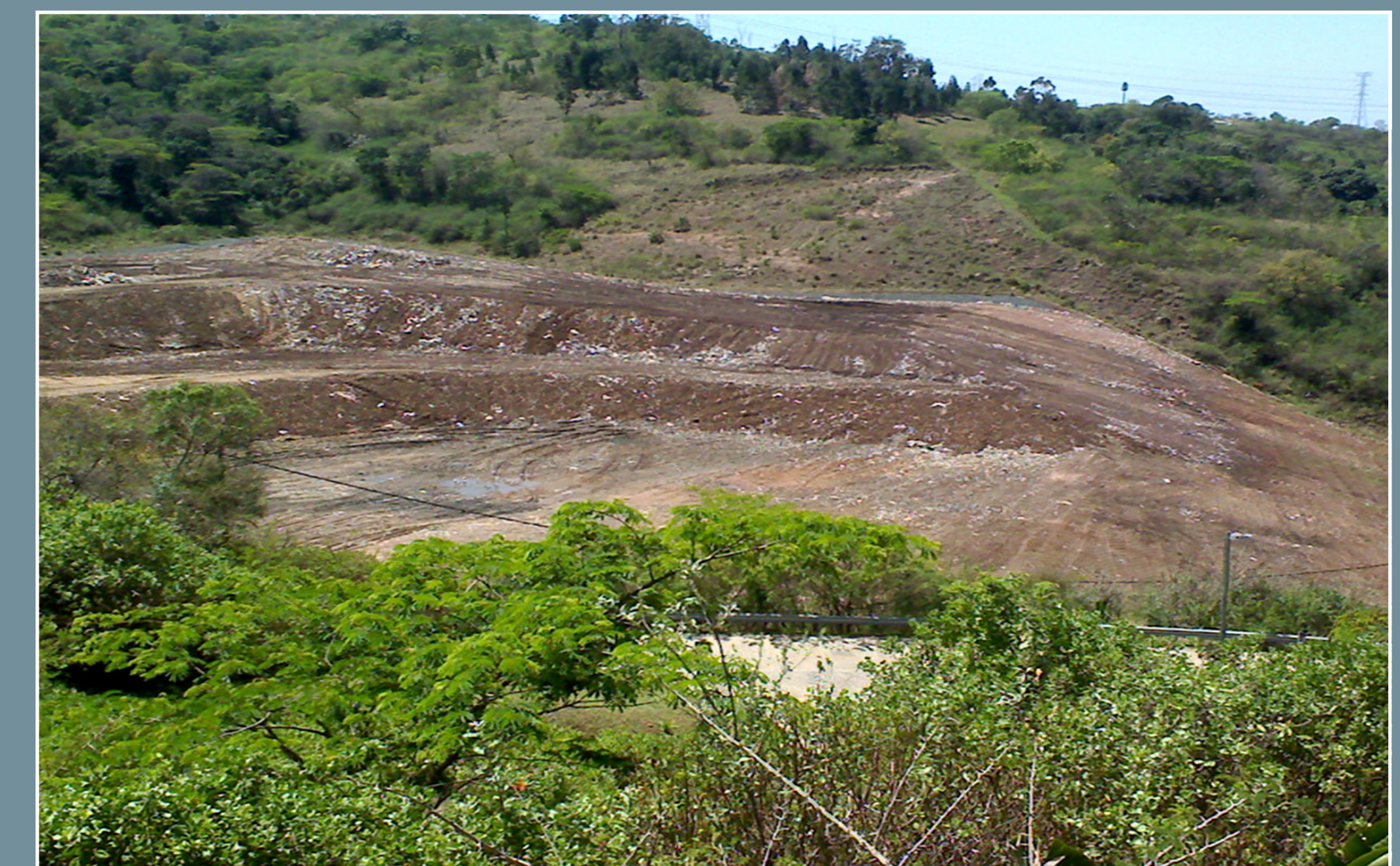
Abandoned small scale gold mine in Kakamega County.

The outcome of the project will be communicated through the guidelines once published. It is expected that the unveiling ceremony of the final document will be graced by ministers responsible for environment and mining and other relevant stakeholders including media, private sector, and some organizations/ companies in the mining sector.