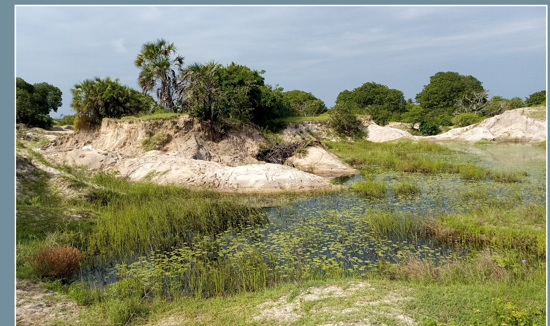
Abadoned Silica Sand Mine in Msambweni.