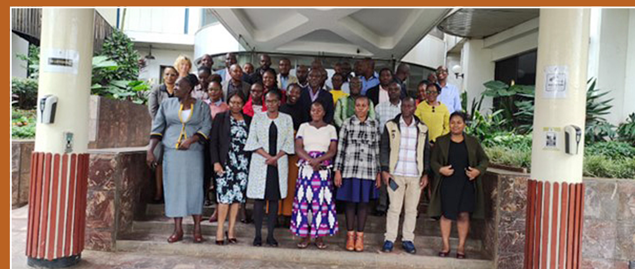
National Validation workshop.

The goal of NEMA and the MoM is to ensure that there are effective and working documents to guide mining operators, Ministries, Departments, Counties and Agencies (MCDAs), environmental practitioners, private sector, Civil Society Organizations (CSOs), etc. in setting up, operating, decommissioning, and rehabilitating mine sites. This will ensure protection of the environment as well as community health and safety through elimination of adverse environmental effects borne out of the mining operations. The long-term vision is to realize a mining sector that promotes a clean, healthy, and sustainable environment for all.