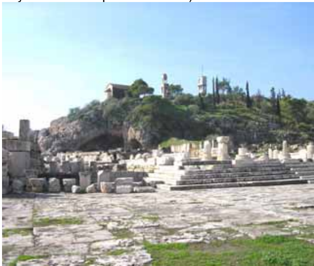
Fig. 1: Eleusis (ancient city where the Eleusinian Mysteries, rituals celebrating nature, used to take place in ancient Greece).

This project argues the importance of recording cultural trails with important geological-geomorphologic components for geo-tourism and educational use, in Attica, Greece. A pilot application of such a scheme could be undertaken along a historic itinerary, the Procession Road: from Eleusis (ancient city where the Eleusinian Mysteries, rituals celebrating nature, used to take place in ancient Greece, fig. 1) to the “ Eleusinian in the city” under Acropolis of Athens (fig. 2), via Iera Odos (Procession Road). Known since the time of the Eleusinian Mysteries, the itinerary includes areas of special geomorphologic interest related to cultural events as well as two UNESCO World Heritage Sites (Daphni Monastery and the Acropolis of Athens).