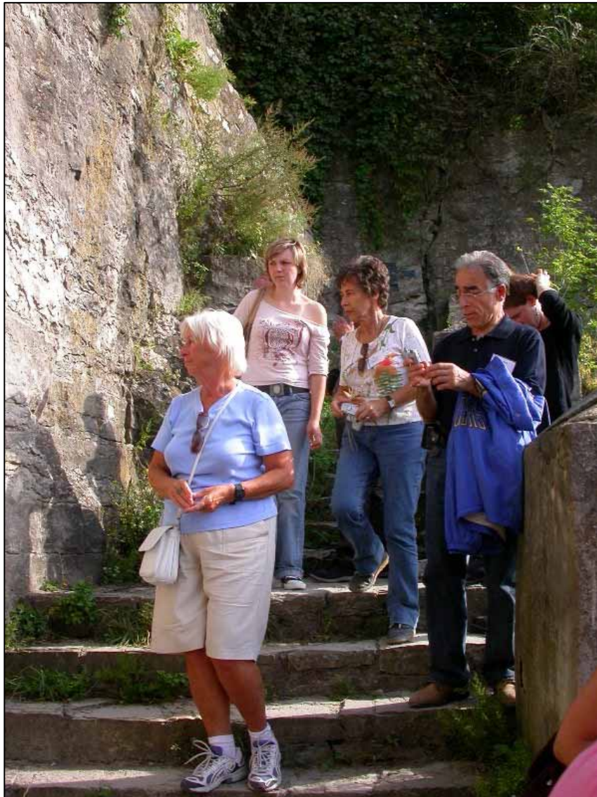
Fossil-rich rockwall at a walking path in a canyon, Kaminets-Podol'sky

The post-symposium excursion was held in an entirely different part of Ukraine, in the district around the city of Kamianets-Podol'sky, near the boarder to Moldova.