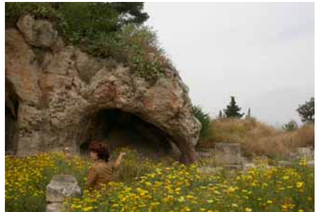
Fig. 3: Karst and caves in the Eleusis archaeological site connected with the Eleusinian Mysteries (cultural geotopes in Cretaceous grey limestones)

The geo-trail has already been designed and a number of sites/stops of geological interest connected with cultural activities have been identified. These cultural geosites of both historical and tourist value will be subject of interpretation for a geo-tourism guide and an educational publication aiming to provide information and increase public awareness.