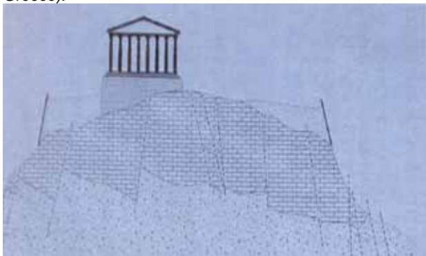
Fig. 2: Schematic representation of the Acropolis in Athens and its geological-tectonic regime.