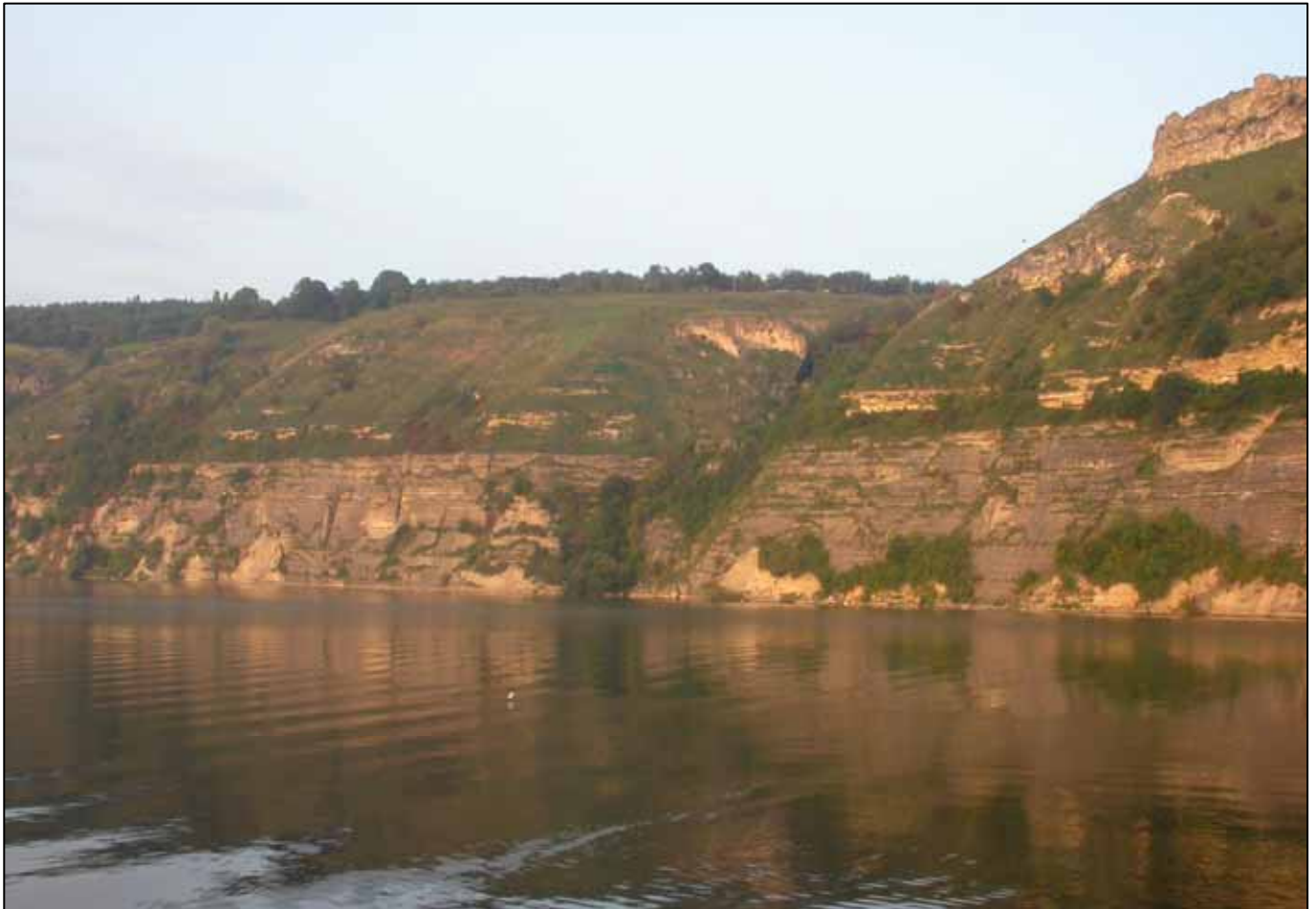
Tertiary reef structures overlying gently dipping Precambrian and Palaeozoic sediments at the bank of the Dnistr reservoir.